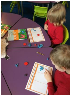
Connectivity, Resilience and Collaboration

Voyagers have been looking at stereotypes in our Jigsaw lessons, exploring regrouping in maths and learning about Elizabeth 1.