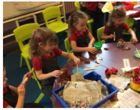
Papermache coffee beans

Voyagers have learnt about why bananas are so important and why they are endangered. We have made paper-mache bananas in all shapes and sizes to display how we as consumers need to change our attitude towards the food we buy. We have taken part in the Fair trade bake off and made Banana and Chocolate Muffins.