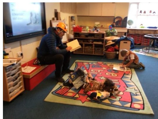
Stop, Drop and Read

Our 'Readathon' sponsored read finishes on Monday 5 th March. So far we have raised over £300 but it is not too late to register donations online or bring cheques into school. All money raised goes to support children with books in hospital.